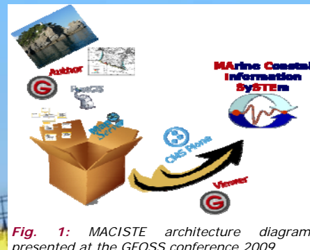
Fig. 1: MACISTE architecture diagram, presented at the GFOSS conference 2009.

The marine-coastal ecosystem model used has been developed using RODBMS PostgreSQL with PostGIS spatial extension. Data are inserted into MACISTE using automated procedures or dedicated input forms. The web-portal can manage user generated contents (e.g. documents, images, multimedia information) and can provide the access to linked applications or software (e.g. R software), depending on the access rights.